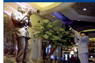
New Orleans - "Birthplace of Jazz"