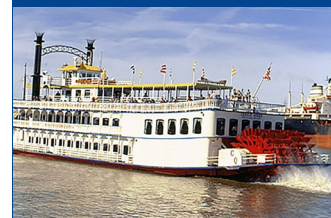
Enjoy a Riverboat Cruise