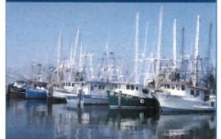
The Beautiful Gulf Coast Awaits

Day 6: Today after enjoying a Continental Breakfast, you depart for home... a perfect time to chat with your friends about all the fun you had and where your next group trip will take you!