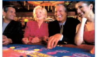
First Class Gaming