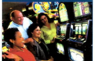
Give Lady Luck a Spin!